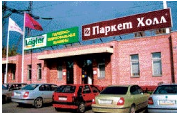
Parquet Hall service-center for Lägler-machines in Moscow.