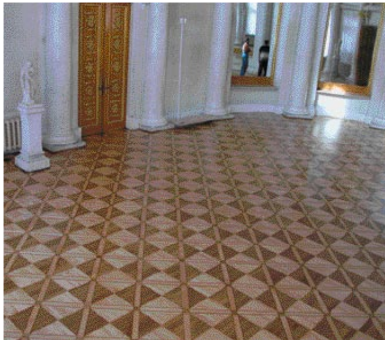
All in all, the sanded surface was sealed by three applications of primer and Eukula Strato waterborne lacquer.