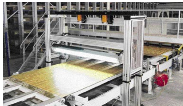
GreCon offers a solution for economic quality control of laminate flooring.